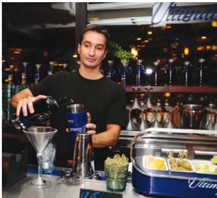
Above: Cocktails at a launch event in New York for Patrón’s Ultimat Vodka