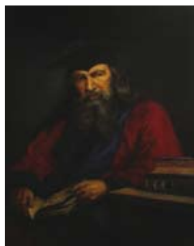
Top: historical artefacts at the Vodka History Museum, Moscow. Below: Russian chemist Dmitri Mendeleev