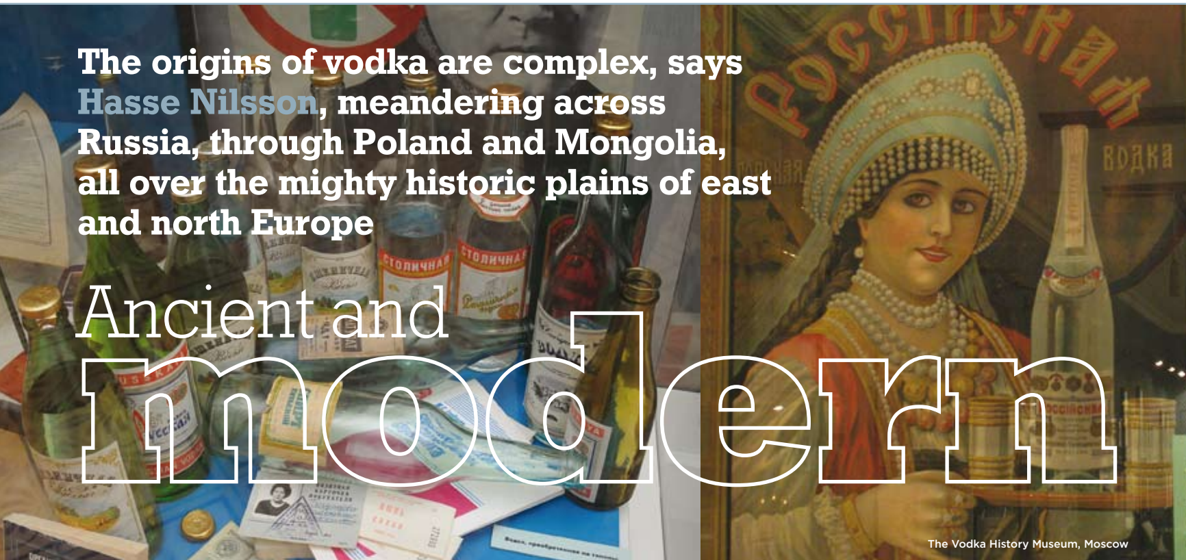
The Vodka History Museum, Moscow

E xactly where the cradle stood we do not know; of exactly what was once imbibed we can have no clear concept. But spirits historians are in agreement that vodka is a truly ancient beverage.