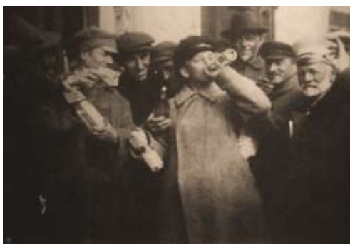
Russians celebrate in appropriate fashion as the country's 'dry law' ends in 1924