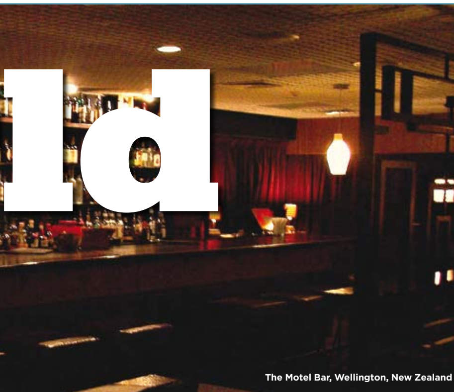
The Motel Bar, Wellington, New Zealand