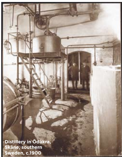
Distillery in Ödåkra, Skåne, southern Sweden, c.1900